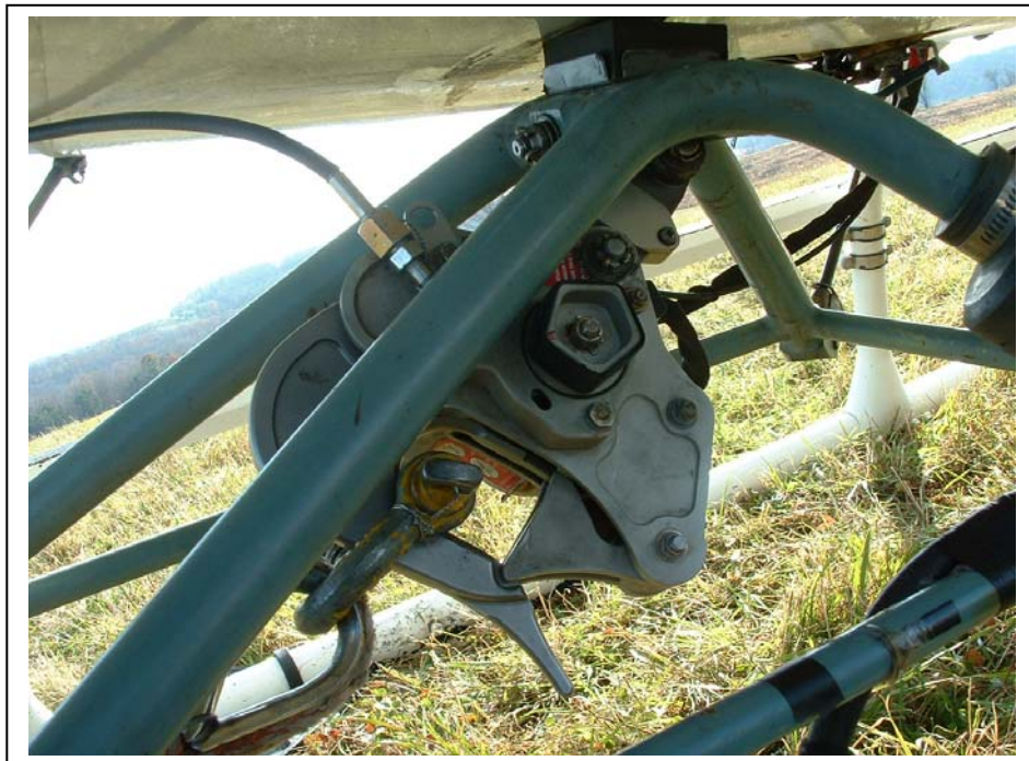
Figure 1. Failure Mode

Cause: Investigation has determined that the uncommanded load releases were a result of the Cargo Hook's knob making contact with the pyramid frame as shown in figure 1. When the Cargo Hook's knob contacts the suspension frame under load, the shape of the knob causes it to be rotated. If the contact is abrupt enough, the Cargo Hook releases.