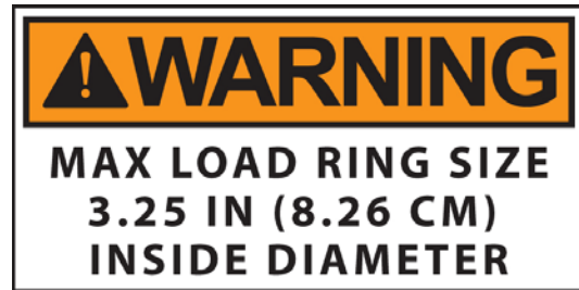
FIGURE 3 — Picture of new decal