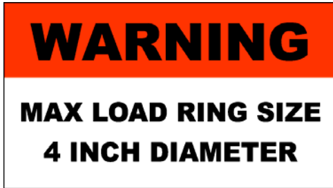
FIGURE 2 — Picture of old decal